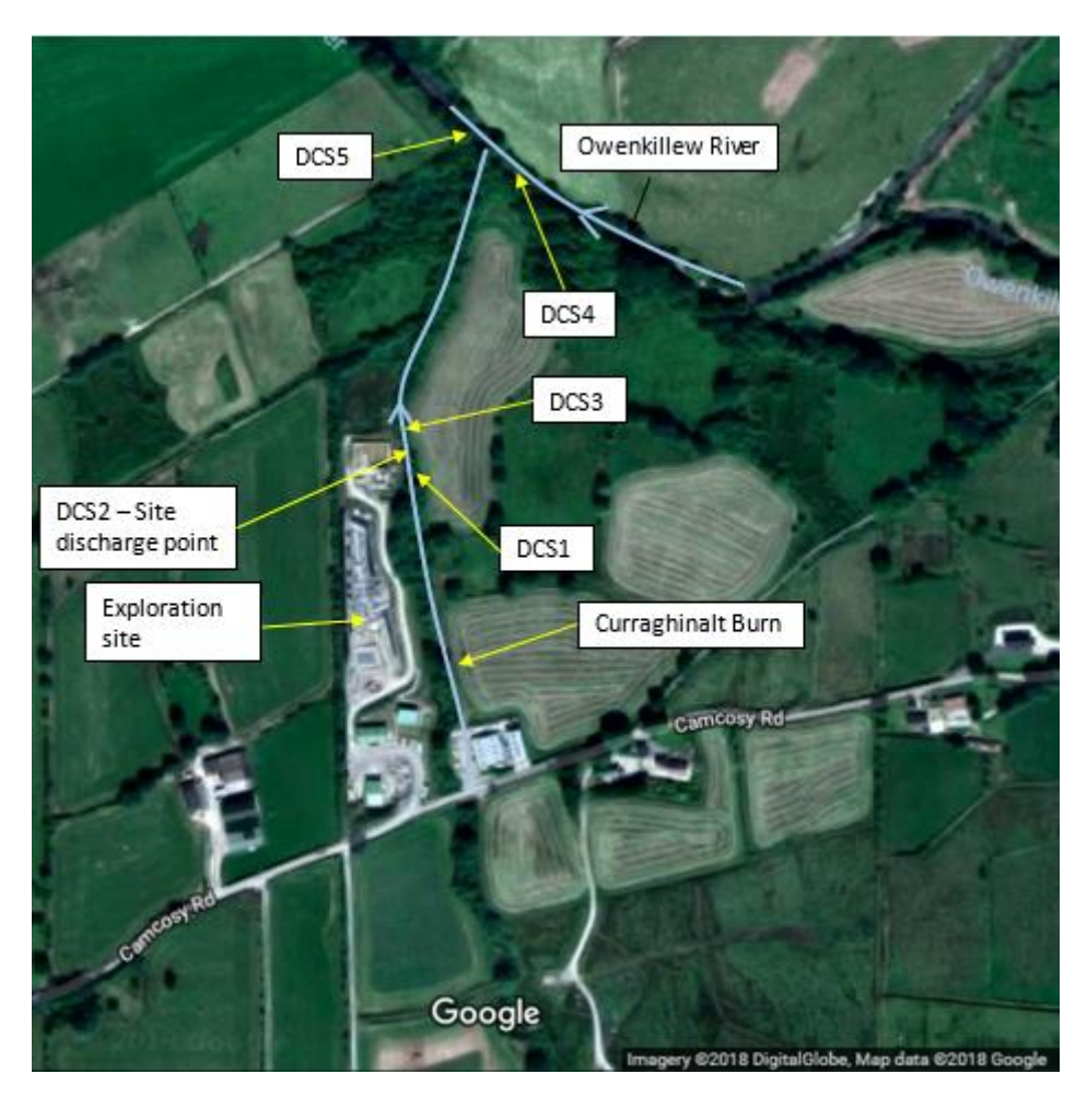
Figure 1: Site map (Google Maps) showing discharge consent sample locations

All surface water samples are collected according to protocols described in the DGL Surface Water Sampling Procedure<sup>1</sup>. To help ensure quality results, care is taken not to disturb stream bed sediments upstream of the sampling point and prior to sampling. Samples are collected at all locations by a DGL Field Technician wearing a fresh pair of nitrile gloves and from the flowing stream of water to minimise any risks of contamination. All sample bottles are laboratory supplied and are filled to capacity at source.